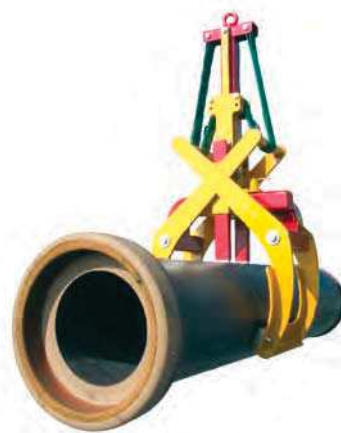
PipeFIX medium PipeFIX light